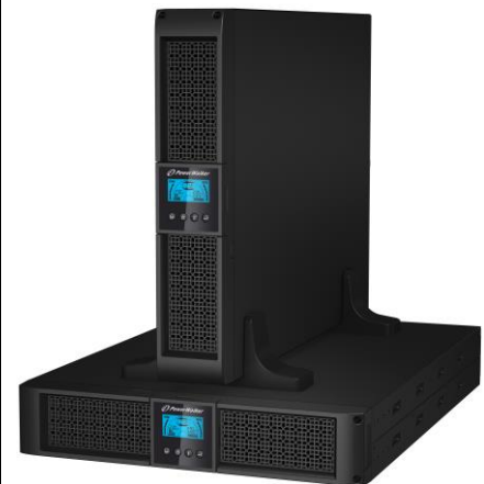
VFI 3000 PRT HID