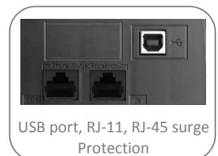
USB port, RJ-11, RJ-45 surge Protection